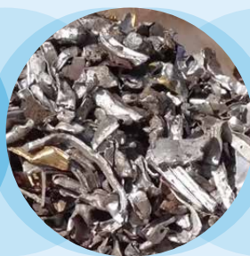
Non ferrous metal