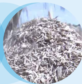
Quality final material